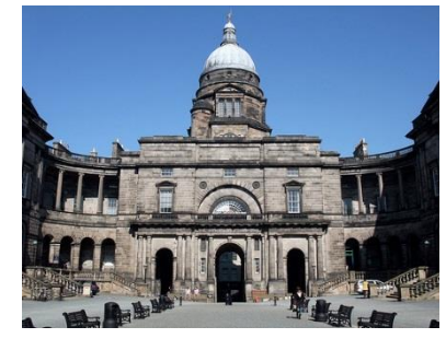
University of Edinburgh